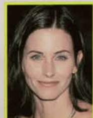
COURTENEY COX ARQUETTE

SIZZLE...OR FIZZLE? What life is like with guys 5, 10, even 15 years younger. PLUS: A-list celebs who break the rules for romance